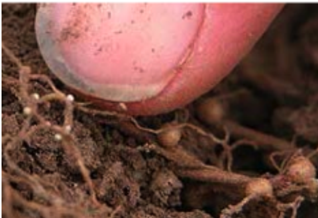
Figure 2. Cysts of soybean cyst nematode (white structures by tip of finger) on soybean roots. Note much larger nitrogen fixation nodules to the right.